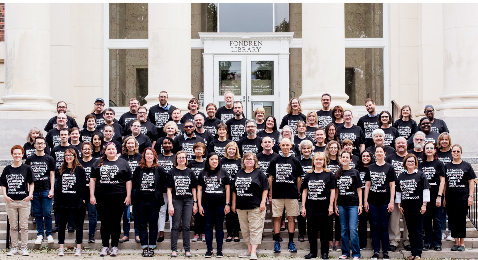
SMU Libraries staff photo taken pre-pandemic

Member, Encoding Standards Subcommittee/Cataloging and Metadata Committee, Music Library Association